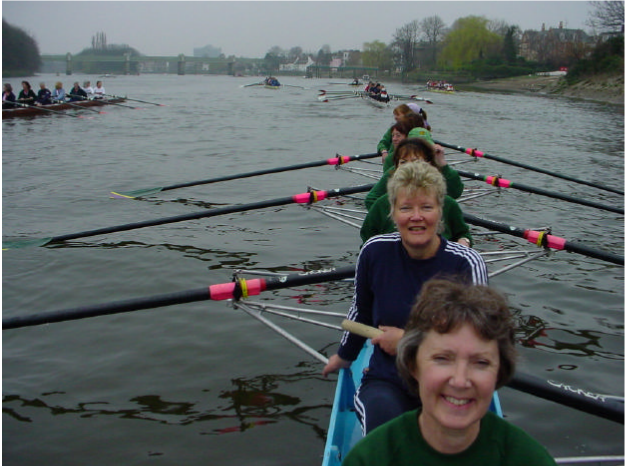
Our women's Vet D VIII in the marshalling zone above Chiswick Bridge before their row in the Veterans' Head