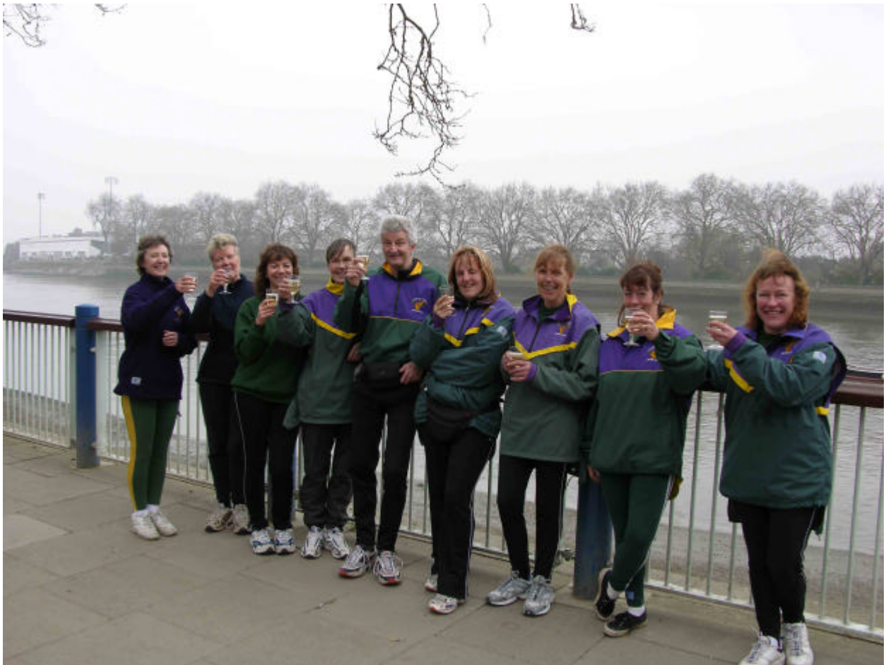
The women's Vet D VIII replacing lost body fluids on Putney Embankment after the Vet's HoR 2005.

Yes, once again it's time to grease those buttocks and dig out that extra-comfy cushion to keep you smiling all through the marathon row. Please check the notice board in the boathouse and sign your name up. Helen and I will be yomping up a fell in the Lake District that day, but we'll be thinking of you, buttocks and all!