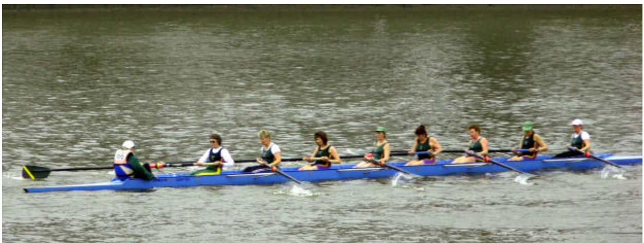
Approaching the finish at Putney – you can almost hear the grunts!